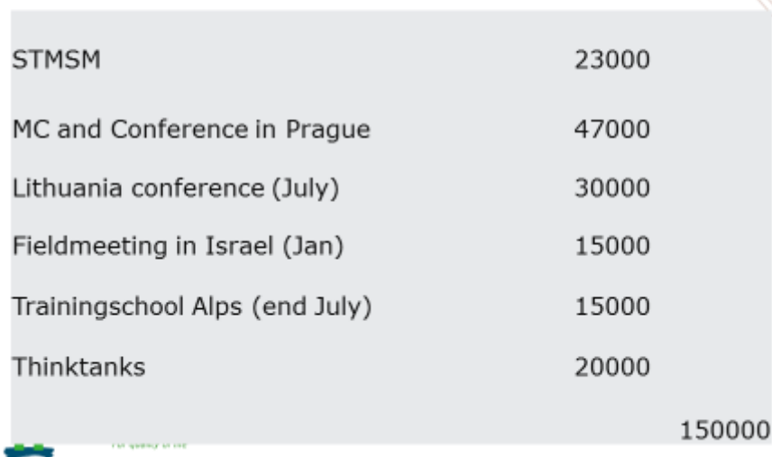
Figure: The preliminary budget for year 3

The global planning for year 3 was unanimously accepted by all present members of the MC.